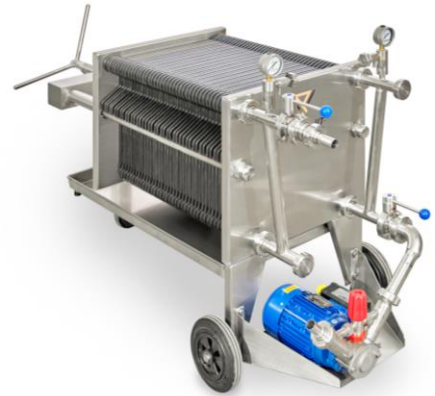
Plate Filter is made from many layers of cellulose filter pads, which repeatedly filtrate the liquid every time it comes through another filter layer. Machine has an integrated pump which supplies the liquid. Plate Filter is made from stainless steel AISI 304 and is available on wheels and in desk type.